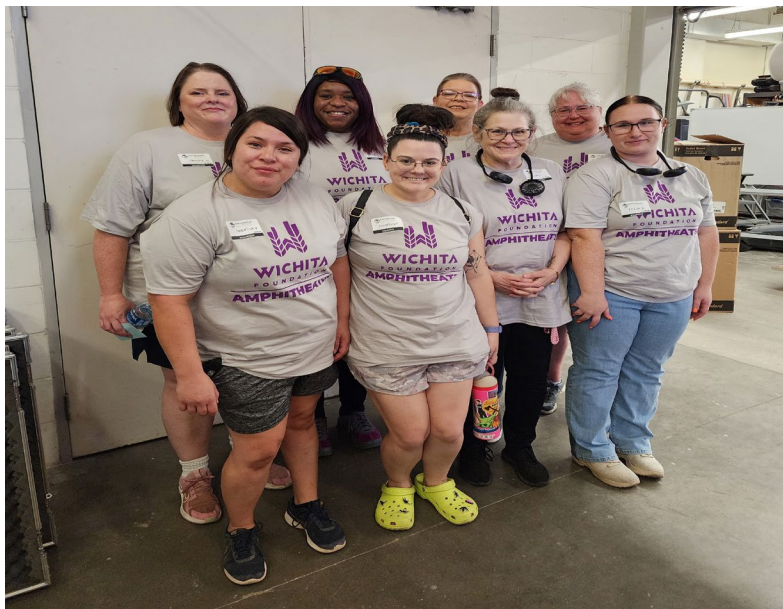
Exploration Place 2024 Drone Show

Exploration Place is looking for volunteers to assist with the 2024 Boo Fest on Saturday, October 26, 2024, from 5:00 p.m. to 9:45 p.m. Volunteers must be at least 14 years of age and any under 16 must volunteer with an adult. There will be trick-or-treat stations set up in the exhibits with candy and toys as well as games and kid karaoke. As volunteers, we will help with set up, run stations, and tear down. You will receive a volunteer t-shirt (different from the one we received with the drone show) and you can accessorize with fun Halloween accessories. Please contact Tara Aguilar at tara@graybillhazlewood.com if you want to volunteer.