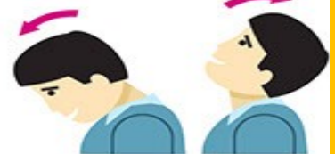
HEAD UP AND DOWN 5-10 seconds / 3 times