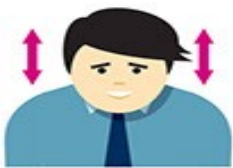
SHOULDERS 3-5 seconds / 3 times