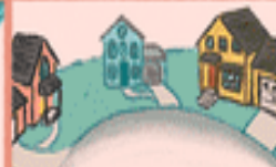
28. National Neighbor Day