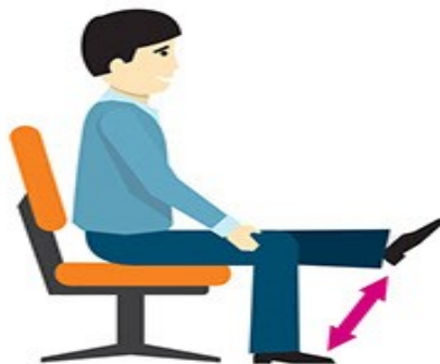
UP-DOWN LEGS 3-5 seconds / 3 times