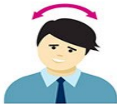
NECK 5-10 seconds / 5 times