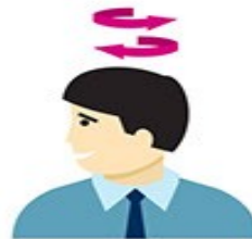
TURN HEAD 5-10 seconds / 3 times