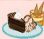
4. Eat an Extra Dessert Day