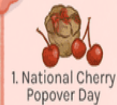
1. National Cherry Popover Day