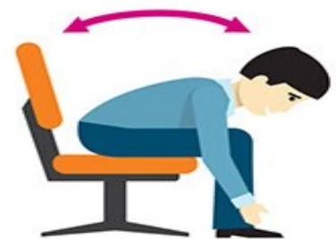
BEND FORWARD 5-10 seconds / 3 times