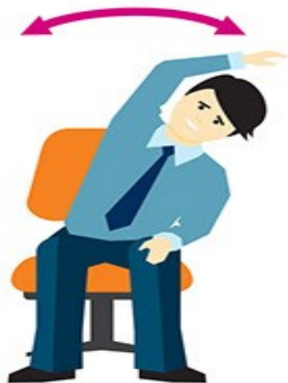
BEND 5-10 seconds / 3 times