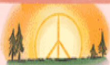
21. International Day of Peace