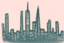
3. Skyscraper Day