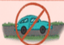
22. World Car-Free Day