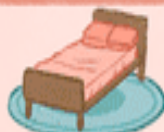
11. Make Your Bed Day