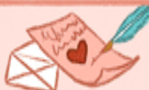
27. Love Note Day