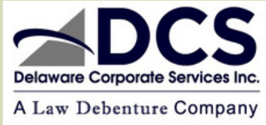
Delaware Corporate Services, Inc.