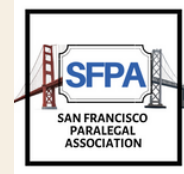
San Francisco Paralegal Association