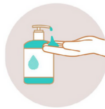
Use Hand Sanitizer