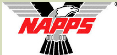
National Association of Professional Process Servers