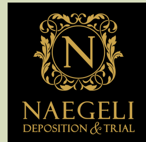
Naegeli Deposition & Trial