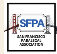
San Francisco Paralegal Association