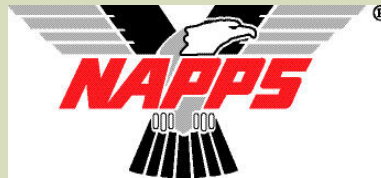
National Association of Professional Process Servers