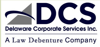
Delaware Corporate Services, Inc.