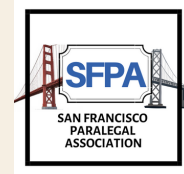
San Francisco Paralegal Association