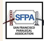
San Francisco Paralegal Association