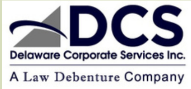
Delaware Corporate Services, Inc.