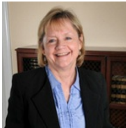
Honorable Elizabeth K. Dillon, Judge United States District Judge for the Western District of Virginia