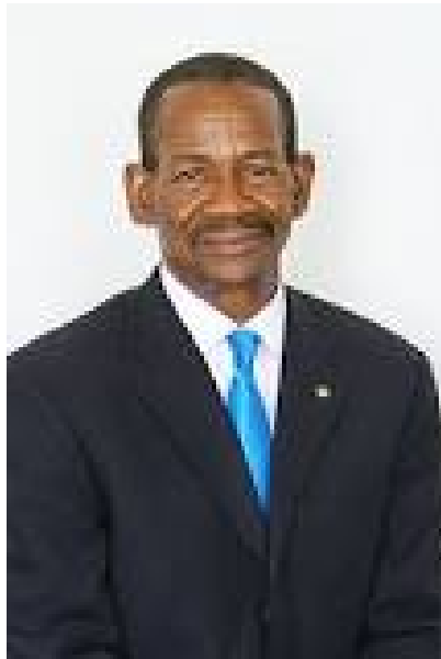
Honorable Onzlee Ware, Judge Roanoke City & Salem Circuit Court